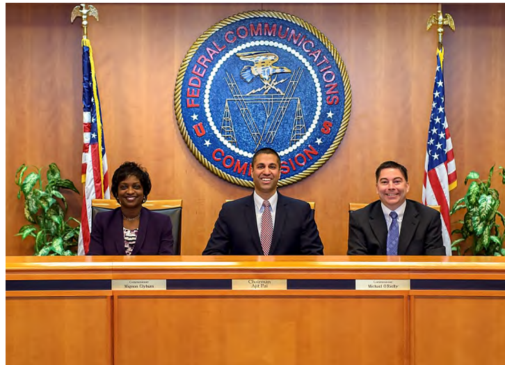
Clyburn June 2017