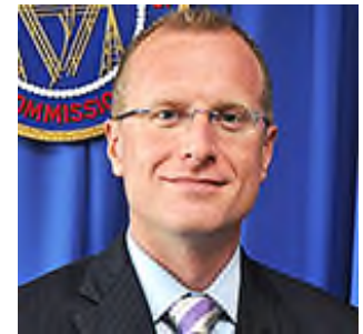
Brendan Carr June 2020