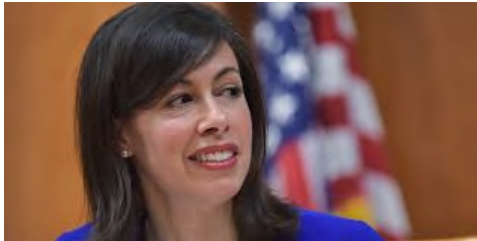
Rosenworcel June 2018